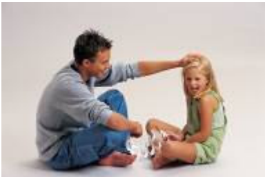
TCF Elgin, IL

We wish all of our bereaved fathers a day of peace. In the midst of grief and loss, may you experience a taste of good memories and remembered love for your child.